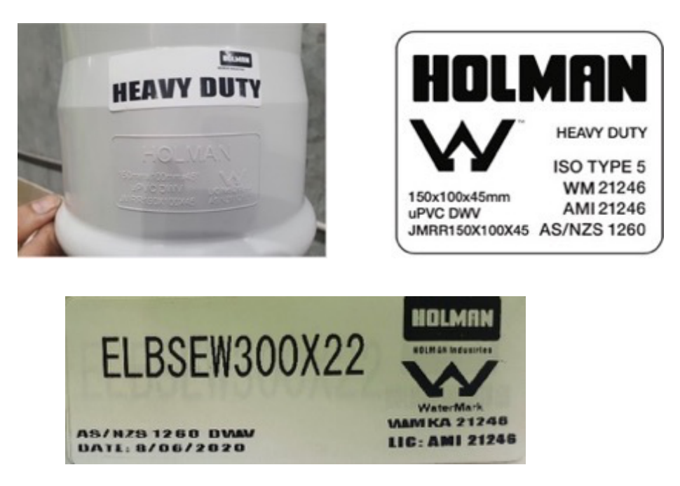
FIGURE 1 TYPICAL MARKINGS

Figure 1 shows typical markings for Holman PVC-U DWV moulded and fabricated fittings.