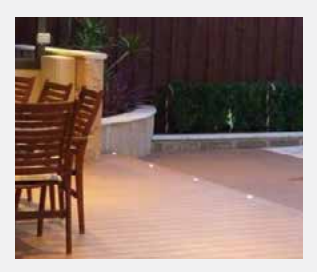
Deck Lights: Light up the perimeter of your deck to enhance your outdoor entertaining area.