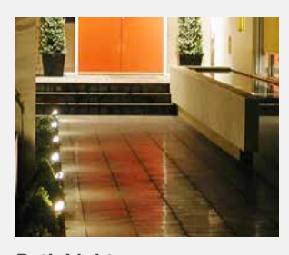
Path Lights: Create a statement entrance to your home by lighting pathways around your front door.

Spotlights: Great for illuminating individual plants or trees and turning them into a garden feature.