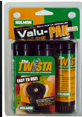
Retail hang sell 6 Pack Qty